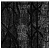
cotton chenille Mumbai