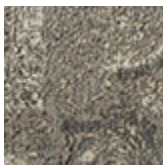
cotton chenille Chennai